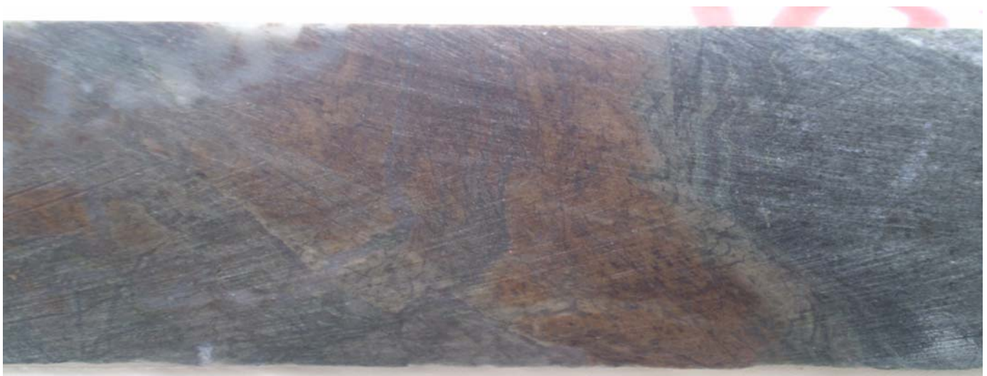
BRC111D (131.1-131.25m). Sheared Basalt. Characterised by silica-flooding and pinky cherty material, sulphides and carbonate. Assay value 131-132m - 9.69 g/t Au

Diamond core drilling aimed at testing depth extensions to the Halleys East mineralised zones returned intercepts including 1m @ 11.35 g/t Au (from 242m), 1m @ 9.69 g/t Au (from 131m) and 1m @ 6.18 g/t Au (from 141m). The mineralisation at depth is interpreted to comprise a number of ENE to NE (060-070°) striking, steeply dipping zones. Observations from diamond core show the mineralised zones are characterised by intense silica-flooding and pink-pale green cherty material, with associated diopside, carbonate and sulphides. Brecciation was also noted.