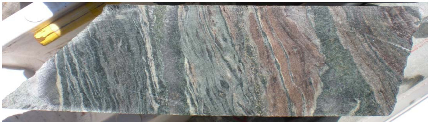
BD001 – Laminated silica-pyrite zone. Phil South.

BD001, a diamond hole drilled to aid in the structural interpretation of the Phil South mineralised zones returned 10m @ 18.47 g/t Au (inc. 4m @ 41.38 g/t Au) from 69m and 5m @ 14.13 g/t Au (inc. 3m @ 23.11 g/t Au) from 81m within the distinctive laminated silica-pyrite zone.