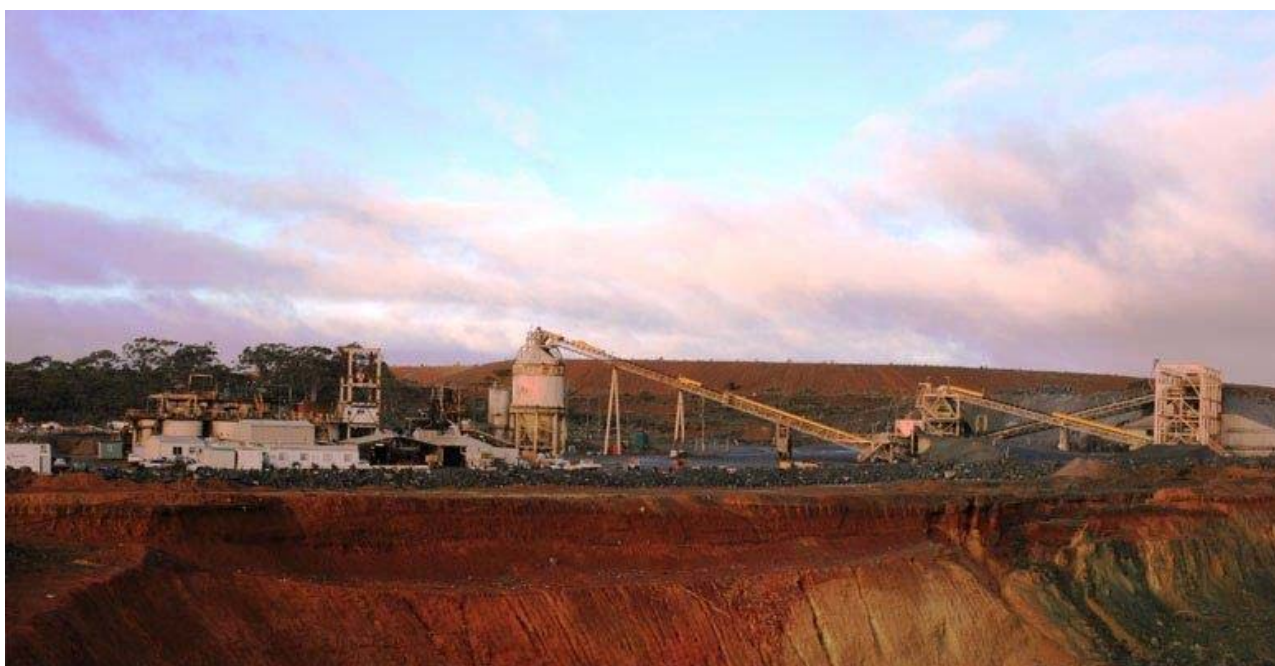
Figure 2 - Greenfields Mill, Coolgardie Western Australia

2,256 ounces of gold recovered during the campaign has been sold at an average price of AU$1,527.76 oz.