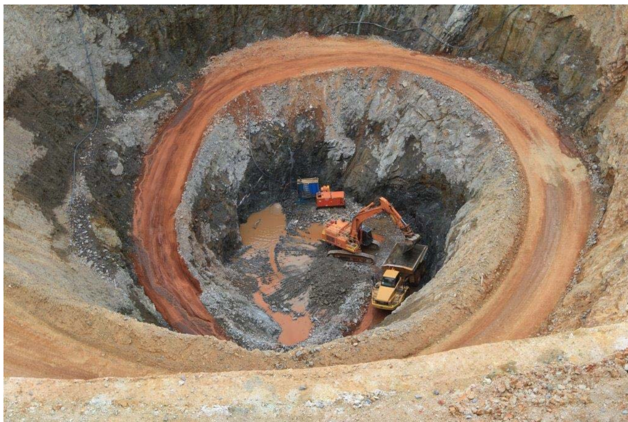
Figure 1 - Halleys East Pit 7 April 2015

The focus this quarter has been to progress the open pit at the Company's operations at Halleys East to its completion. Mining will be completed at Halleys East in April 2015.